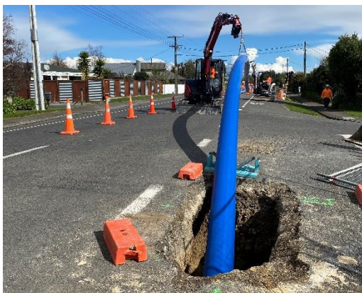
Figure 1: Pipe being pulled through.