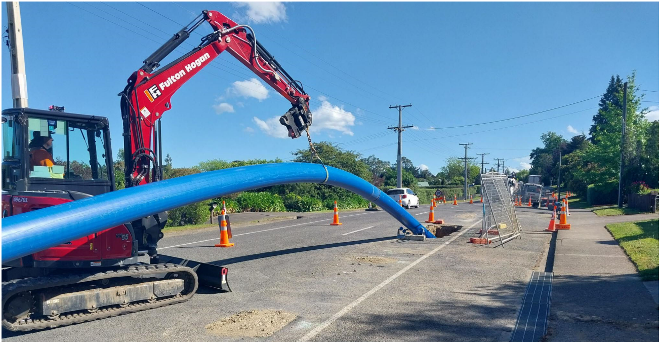
Figure 1: New pipe being installed in stage 2. #