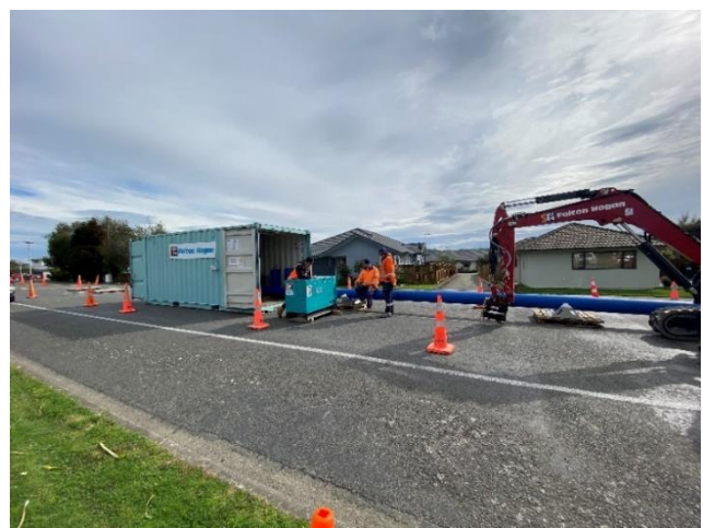
Figure 2: Pipe welding underway in the Fulton Hogan container.