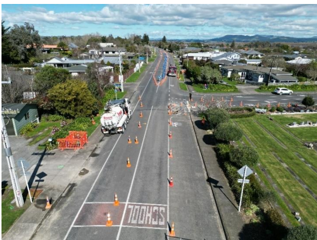
Figure 1: Traffic Management established on site.