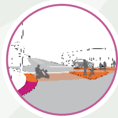
Improved walk & cycle.