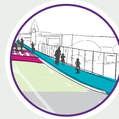
Access to the park.