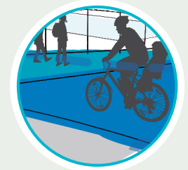
Cycling along SH 2.