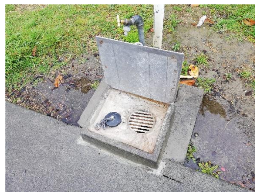
Example of a dump station

The attraction of travellers to stay in local communities, and the subsequent opportunity to promote spending with local businesses infuses money into local communities, sending ripples of economic support throughout the business' entire local supply chain.