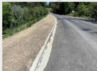
Pōrangahau Road Retaining Wall 177 Russell Roads Complete