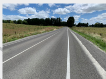
Pōrangahau Road Area Wide Pavement Renewal Russell Roads Complete

Through this two year project we are working to provide future generations with safe and durable roading infrastructure along what is a key thoroughfare in our district. Below is an outline of what we have achieved in Year One of our two year delivery programme from July 2020 through to June 2021.