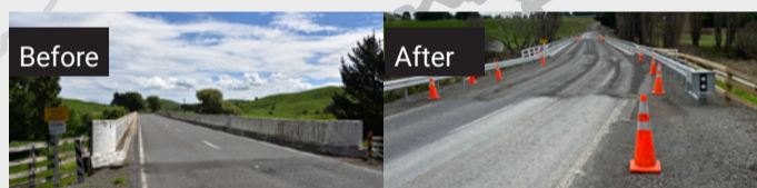
Wallingford Bridge Strengthening Concrete Structures Complete