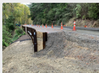
Wimbledon Road Retaining Wall 283 Russell Roads Complete