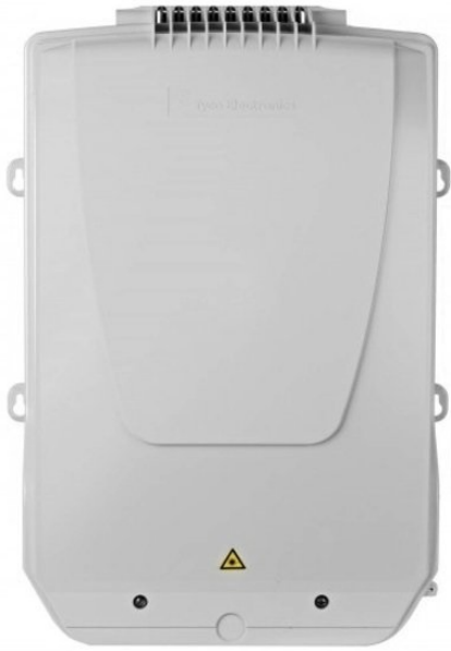
Figure 1 – BUDI Customer Connection Box