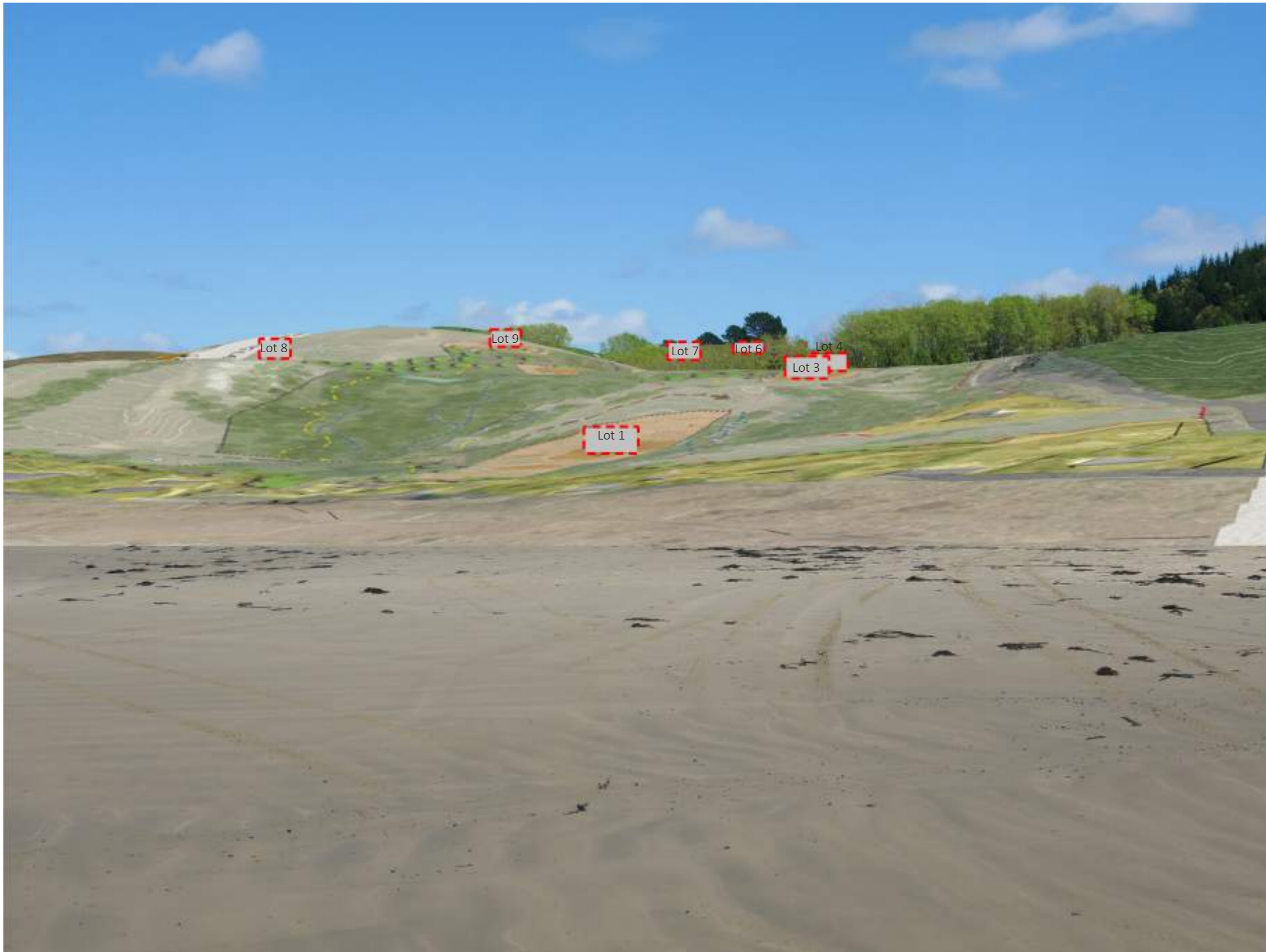
Key Plan- Photo Location